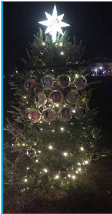
The theme of the Connecticut Christmas tree, which is part of a national display in Washington, D.C., is DIVERSE-CT. The ornaments honor state figures who have had a hand in helping to advance civil rights.