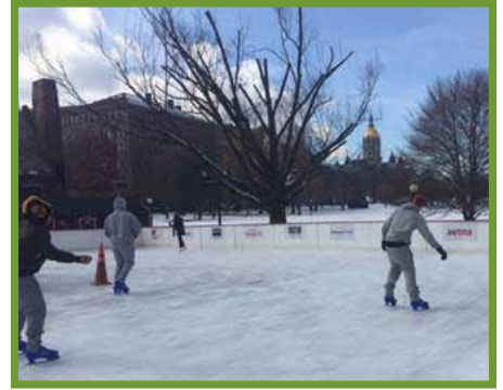
Rushford Academy students toured a number of Hartford landmarks during their trip on Monday, Dec. 11. Left: The group got to see the sights from on, above and behind the stage at the Bushnell Theater. Above: The day ended with a spin around the rink at Bushnell Park.