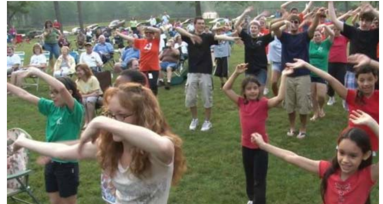
Kids, parents and members of the community got their groove on to spread the message that “Joy is Adolescence~Substance Free!”

The flash mob was a hit among both participants and onlookers, and sent a very important message to all.