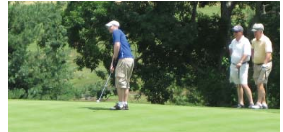
Golfers enjoyed a beautiful day at Lyman Orchards Golf Club for the 23rd Annual Rushford Golf Classic.